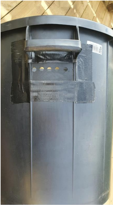
Plastic barrel with drilled holes covered with net